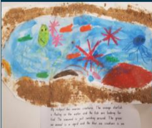
My reefpool has marine creatures. The orange starfish is floating in the water and the fish are looking for food. The seaweed is just swaying around. The green sea anemone is a squid and the blue sea creature is an octopus. Lisa