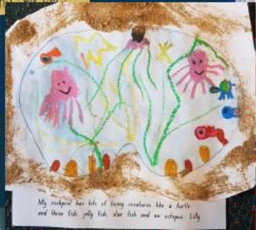
My reefpool has lots of living creatures like a turtle and three fish: jelly fish, star fish and an octopus. Lily