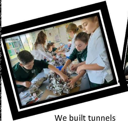
We built tunnels

We made and exploded volcanos (but definitely no earthquakes!)